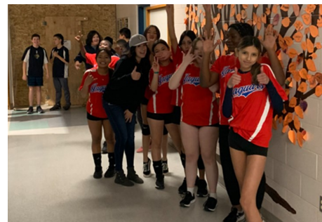
Congratulations to our Jaguar volleyball players on a season well played!